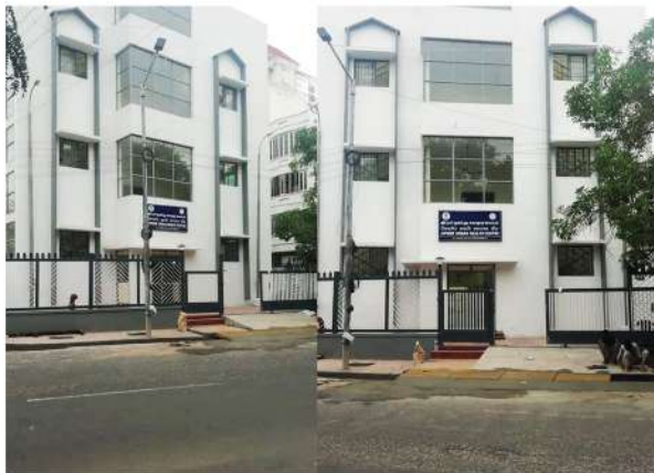
Jipmer Urban Health Centre - 14,000 sq ft, Puducherry