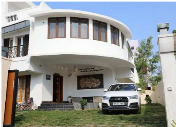
Amitha Residential - 6,200 sq ft, Arumparthapuram