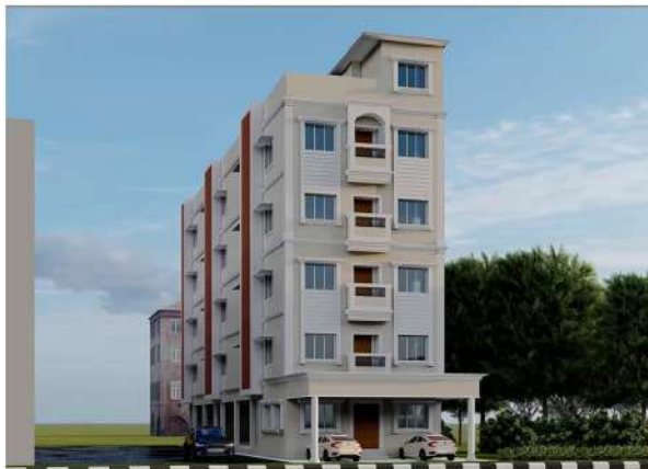
Hotel N.S.J Abimanyu (G+4) Puducherry