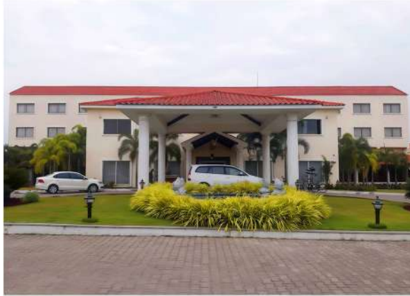
Grand Serena Hotel & Resorts 40,000 sq ft, Puducherry