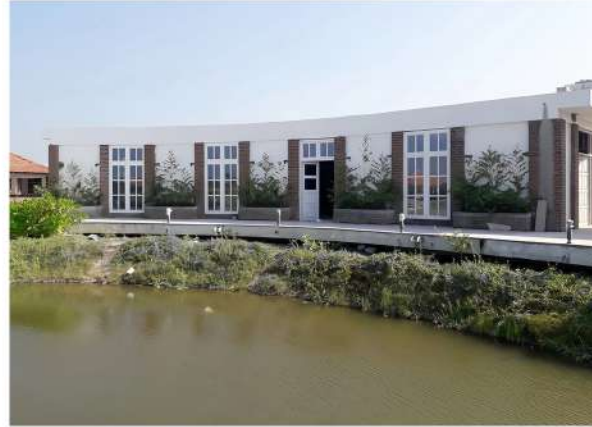
K Resort - 1,00,000 sq ft, Koonimedu, Tamil Nadu