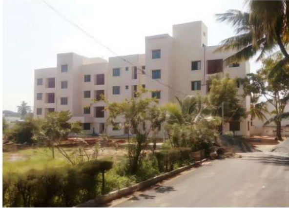
Aravind Eye Hospital PG Hostel - 32,000 sq ft, Puducherry