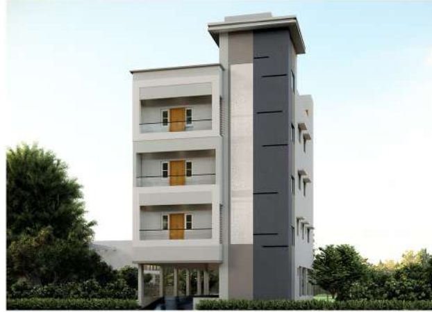
Shenbaga Staff Quarters - 7,910 sq ft, Puducherry