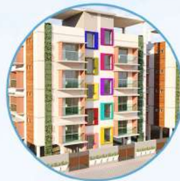
Peacock Apartment 4 BLOCKS - 8 UNITS/BLOCK - 3BHK