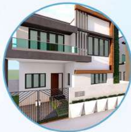
Koel Villa 36 UNITS - 2 & 3 BHK