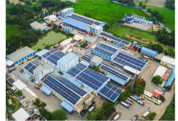
1.5 MW - Abirami Soap Works LLP (Power Soap) Sembiapalayam, Puducherry