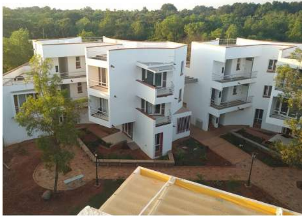
Kalpana Housing - 68,000 sq ft, Auroville, TN