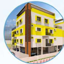
Humming Bird Apartment 3 BLOCKS - 8 UNITS/BLOCK - 2 & 3BHK