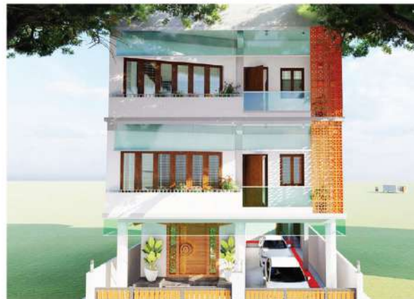
Individual Villa - 4,500 sq ft, Ellaipillaichavady