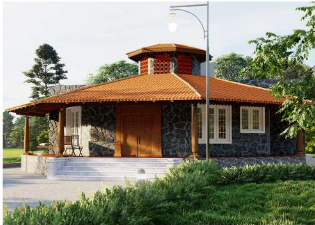
Farm House - 1,580 sq ft, Krishnapuram