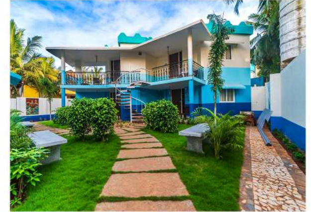
Lamel Cove Beach Resort- 17,500 sq ft, Auroville, Tamil Nadu