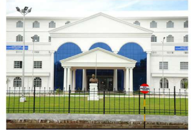
Rajiv Gandhi Hospital - 16,000 sq ft, Puducherry