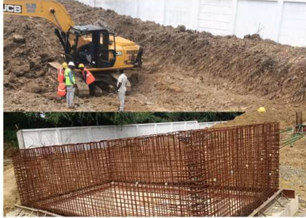
160 KLD STP & 150 KLD WTP MSME Technology Centre Vallam, Sriperumbudur, Tamil Nadu