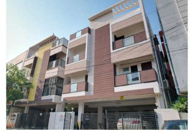
Jehovah Apartment (G+2)- 8,000 sq ft, Chennai