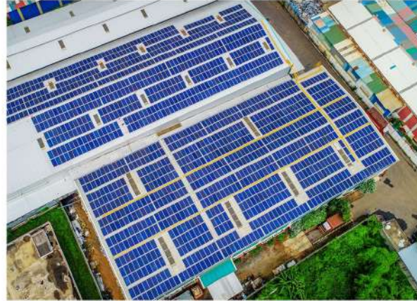
500 KW - Nithya Packaging Pvt Ltd Unit 2, Thiruvandarkoil, Puducherry