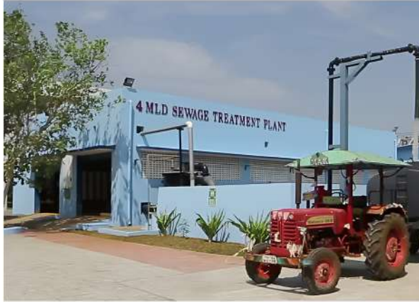
4 MLD - Sewage Treatment Plant IIT-Madras, Chennai