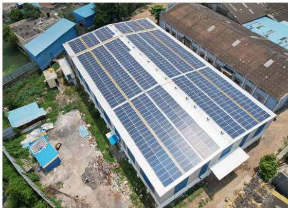
155 KW - APA package Puzhal, Chennai