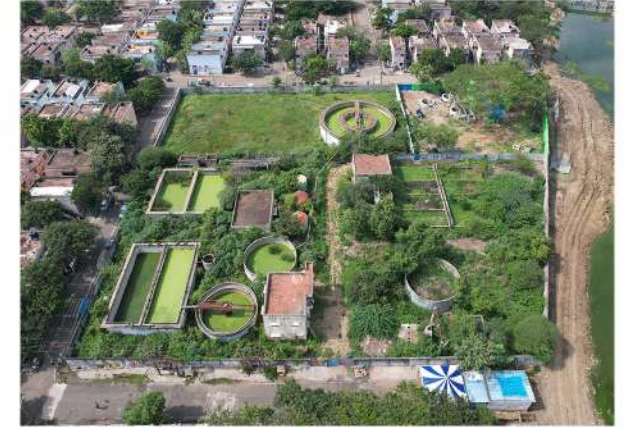
2.2 MLD - Sewage Treatment Plant Semmancheri, Chennai