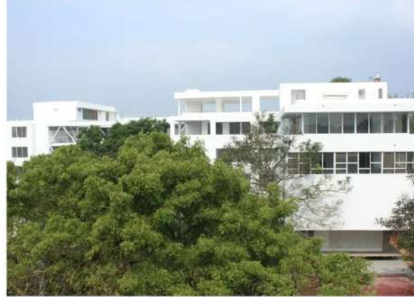
Sunship Housing - 92,000 sq ft, Auroville, TN