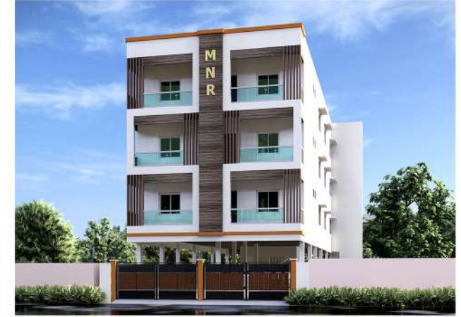
MNR Residency - 8,345 sq ft, Puducherry