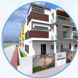
King Sparrow Villa 14 UNITS - 4 BHK