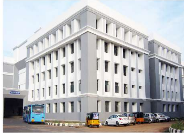
IGMCRI - 28,000 sq ft, Puducherry