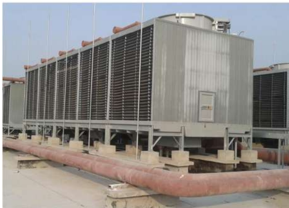
Cooling Towers, Neyveli