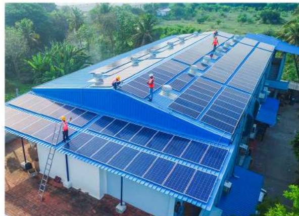
60 KW - SKAN Pharmaceutical Thirubuvanai, Puducherry