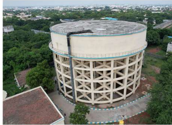
55 Lakhs Litre - Asia's Biggest Overhead Water Tank, Puzhal, Chennai