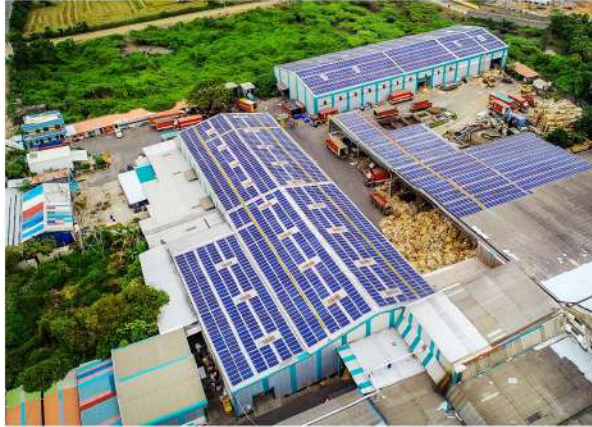
1000 KW - Nithya Packaging Pvt Ltd Unit 1, Villianur, Puducherry